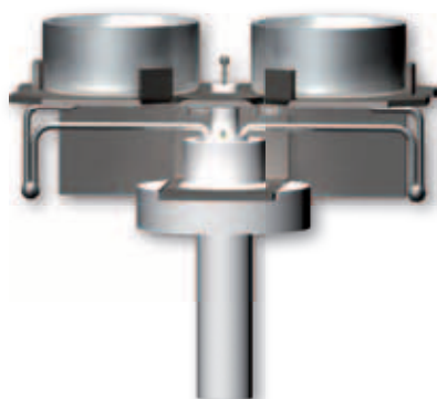
Plate-shaped DSC rod

The DSC131 evo transducer has been designed using plate-shaped DSC rod technology and is constructed from chromel-constantan.