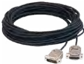
Extension Cables (4, 15, 20 or 25 m)