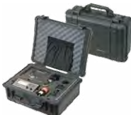
Pelican Carrying Case