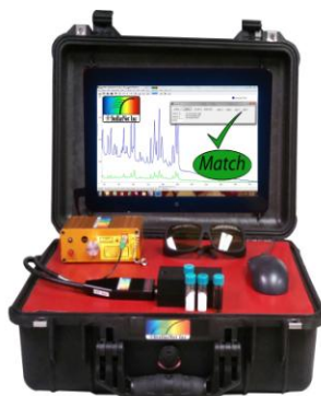
Rugged Case for "Open & Measure" Applications

The system collects your sample's Raman spectrum and sends the spectral data to a tablet with factory installed SpectraWiz ID™ Software for spectral matching. Users may create their own sample library from which to search OR they may join our Raman Library Share program to gain access to our Free Raman Database.