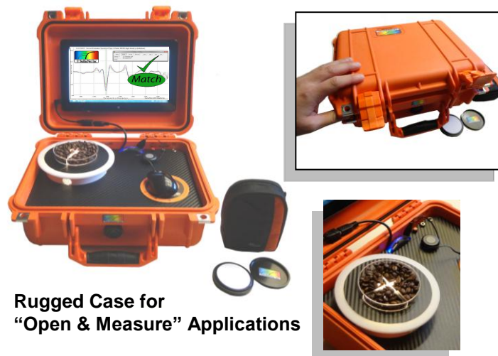
Rugged Case for "Open & Measure" Applications

The StellarCASE features an internal main power control system with ON, OFF, & Charge buttons. The NIR reflectance fixture mounts directly into the system's acrylic mounting surface for easy access.